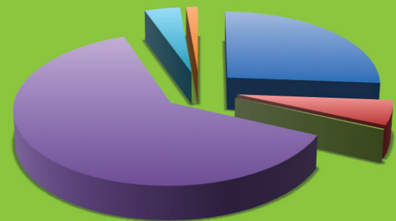
Total number of open programs in the database 4520